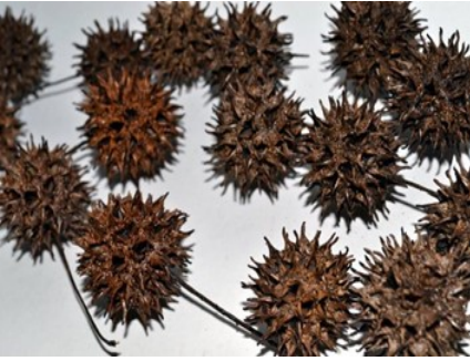
37 BUCKETS...BUCKETS...OF THESE THINGS!!!!

Astonishingly, if you look at our gum ball tree on the playground you might see there are still A LOT of those gum balls still attached. Our Wednesday Friends can always find work to do! So everyone is welcome to join us any and every Wednesday morning between 9:30am & 11:30am.